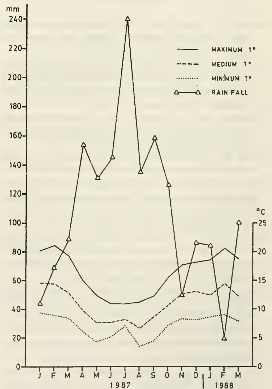
Figure 2. The monthly mean temperature and rainfall at Puerto Montt, from January 1987 to February 1988.

This research was supported in part by INIA and in part by the Dirección de Investigación y Desarrollo de la Universidad Austral de Chile (Grant No S-86-2)